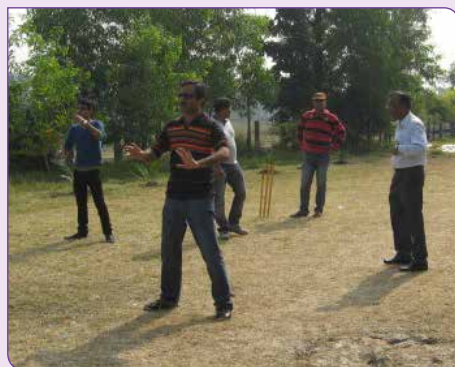
Glimpses from a Team SKP Picnic