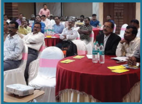
SKP Investor/Partner Awareness Meets Across East