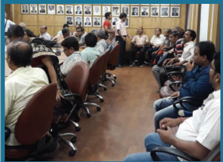
Section of Shareholders