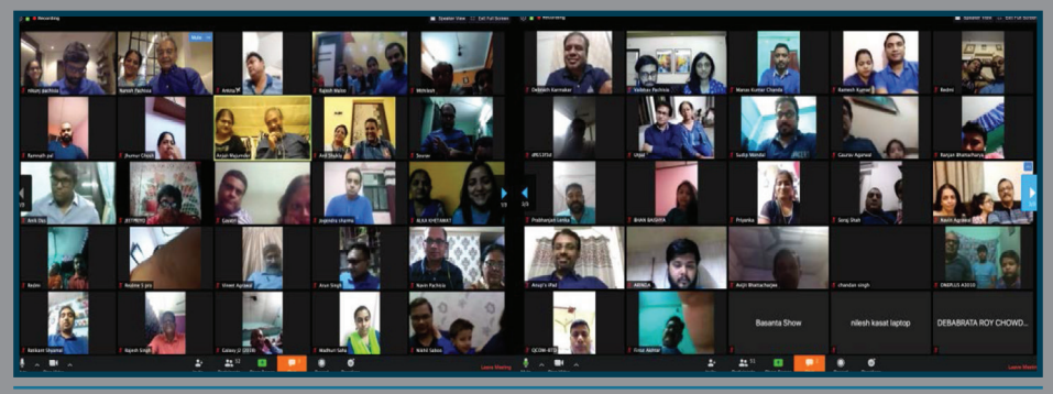
The SKP Excellence Awards Ceremony 2020