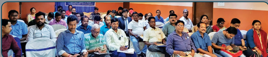
SKP Investor / Partner Awareness Meets Across Eastern Region