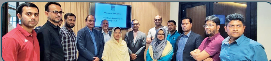
UCB Stocks, largest Stock Brokerage in Bangladesh, on a study tour at SKP